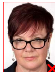
If worn, glasses must not obscure the eyes or have any reflections