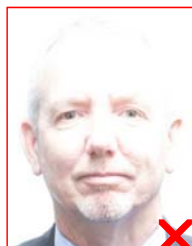
Incorrect image exposure– images cannot be too light or too dark