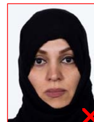
Head-coverings must not cover the face – same with hair