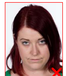
Head must not be tilted down or up